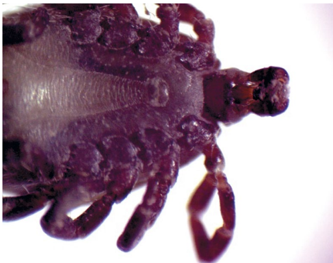
Fig. 7. Male tick coxa 1 external spur