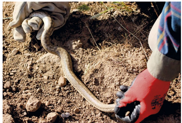
Fig. 4. Snake examined for ticks