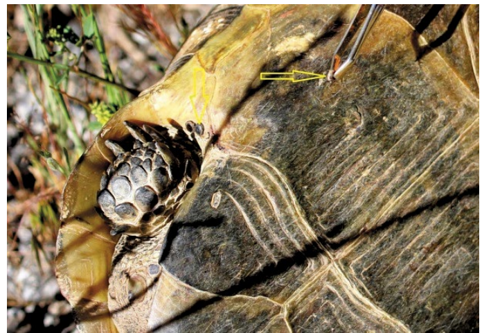
Fig. 2. Collecting ticks from tortoise

Ticks are one of the most important ectoparasites of humans and animals especially in tropical and subtropical regions (17, 18). Out of 899 tick species in the world, approximately 10% play a role in carrying over 200 zoonotic agents such as bacteria, virus, rickettsia