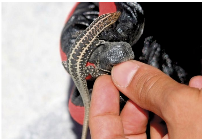
Fig. 3. Lizard examined for ticks