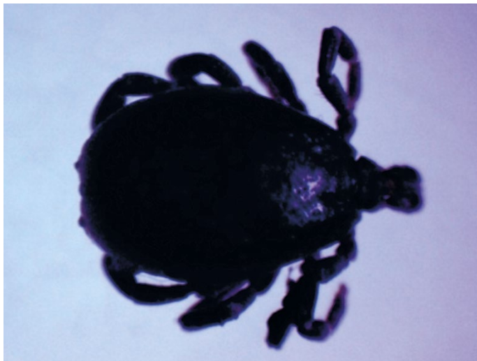
Fig. 6. Hyalomma aegyptium (male)