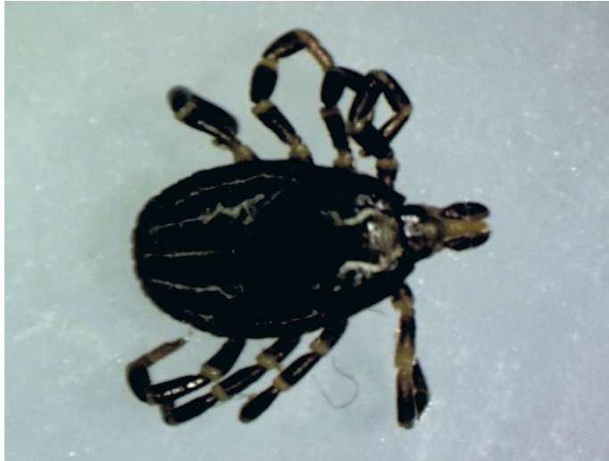
Fig. 5. Hyalomma aegyptium (female)

and protozoa (12, 22). Numerous studies have been conducted in the world to identify the ectoparasites in tortoises and lizards. In a study carried out in Iran, 129 lizards of 3 species and 25 tortoises ( T. graeca ) were examined. It was reported that lizards ( Trachylepis vit-