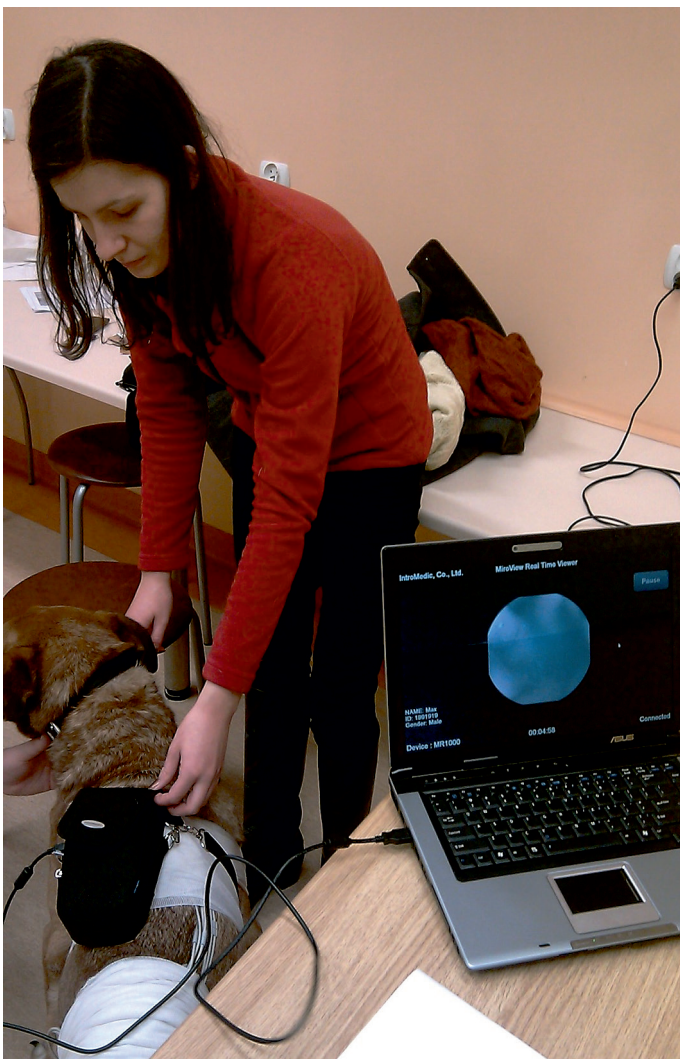
Fig. 3. USB real time viewing of gastrointestinal tract via notebook

which transmits the image to the sensor array (Fig. 2). Capsule endoscopy systems allow real time viewing of the gastrointestinal tract by USB or wireless connection (Fig. 3). The capsule has a special coat which aids passage through the intestine and protects optical components against contamination with intestinal