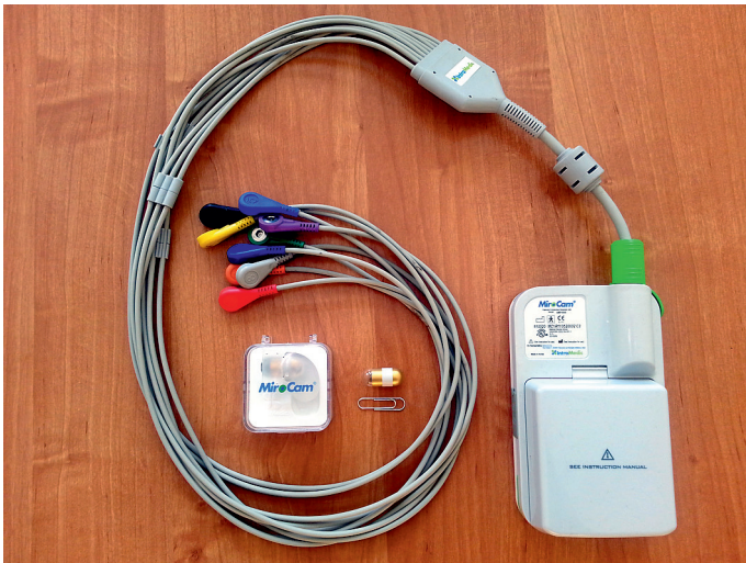
Fig. 2. Data recorder with a battery and electrodes

which transmits the image to the sensor array (Fig. 2). Capsule endoscopy systems allow real time viewing of the gastrointestinal tract by USB or wireless connection (Fig. 3). The capsule has a special coat which aids passage through the intestine and protects optical components against contamination with intestinal