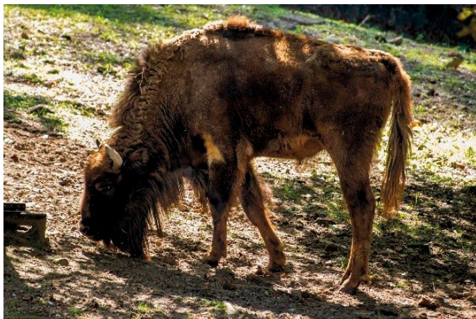
Fig. 1. POLATKA